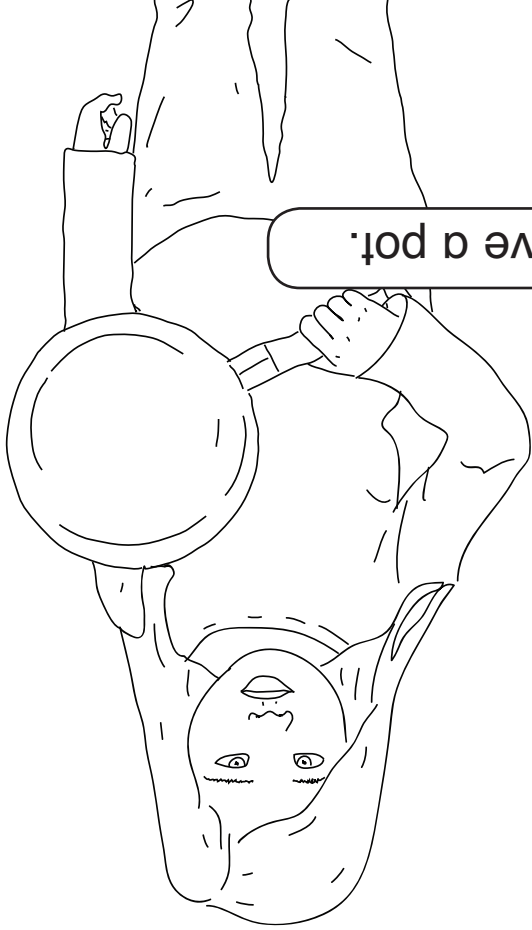
I have a pot.