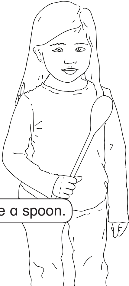
I have a spoon.