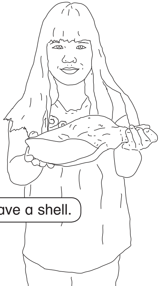
I have a shell.