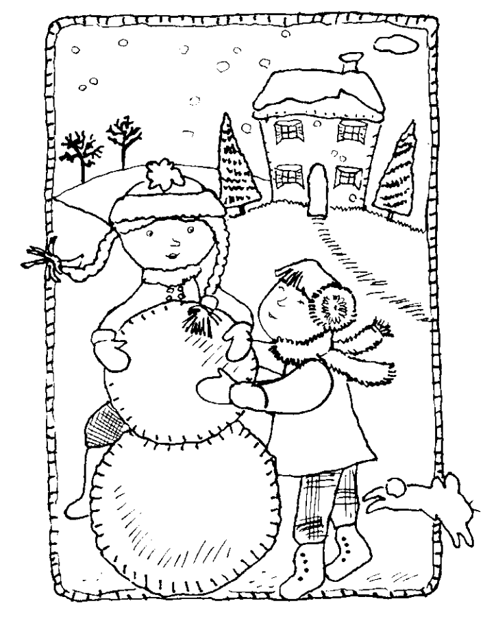
We make a body.

© 2006 Scholastic Canada Ltd. This page may be reproduced for classroom use by the purchasing school.